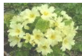
THE FIRST PRIMROSE

https://www.u3a.org.uk/events/educational-events