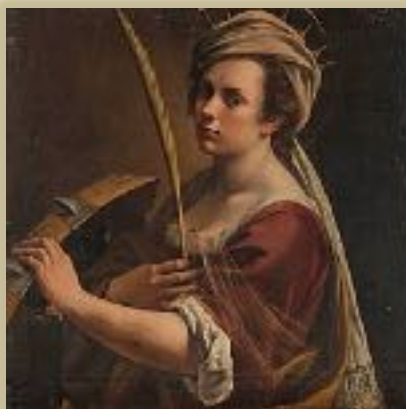
Artemisia Gentileschi – Self-portrait as St Catherine of Alexandria

The National Gallery has only about 20 paintings by women artists in their collection of over 2300 works. Art UK has an interesting article online “The Eight Women Artists of the National Gallery”.