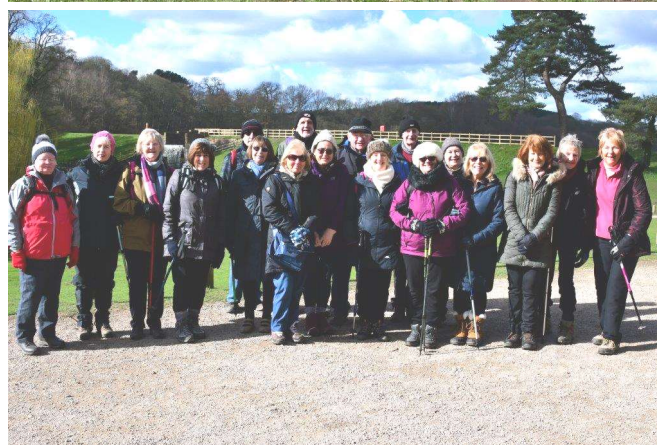
Newstead Abbey, March 2023