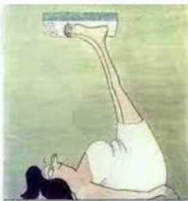
We must get the word out!

How to weigh yourself and get the most accurate result. I can't believe I have been doing it wrong all these years!