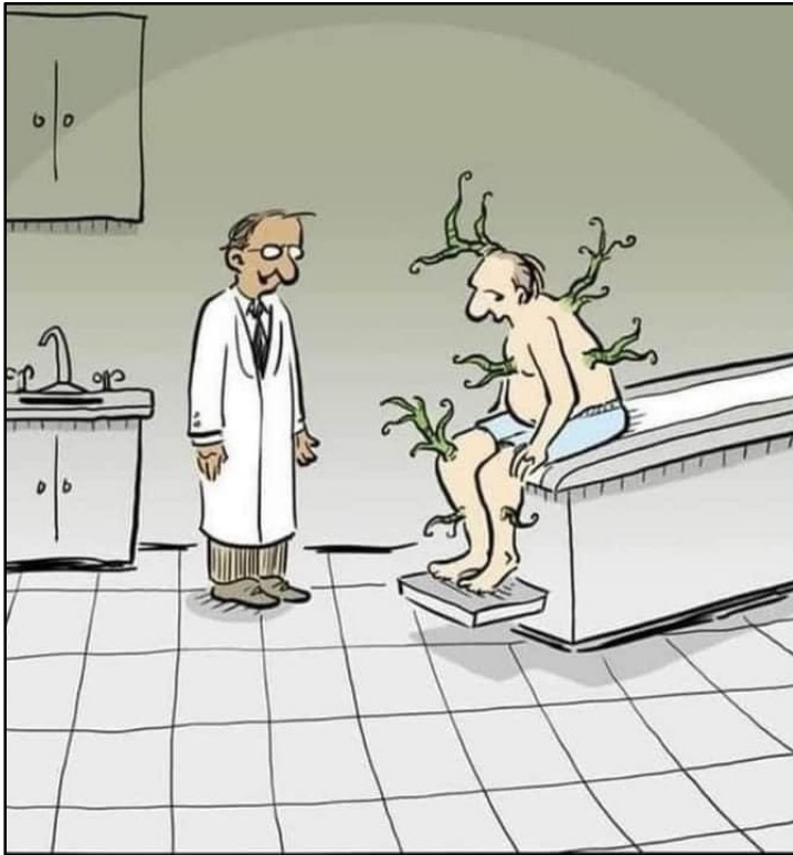
"You have sprouts. It's something couch potatoes get after sitting for too long."

The adult version of "head, shoulders, knees and toes" is "wallet, glasses, keys and phone".