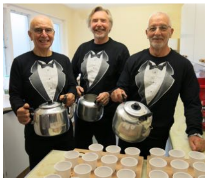
The Three Wise Men??

The Bird Watching group met at Brinsley Headstocks. It was a cool bright day as we made our way along the old railway line. The very first sighting was a Goldcrest followed by many Blackbirds in the leaf litter along with the Robins. A little further along with Wood Pigeons in the fields a flock of Goldfinch arrived in the top of the trees and Chaffinch flying from tree to tree. As we approached a small area, designated as a nature reserve, Blue Tit, Great Tit and Coal Tit were seen. The old rail track is lined with trees and it seemed that every other tree had a squirrel! Next we saw a flock of Siskins eating seeds in the treetops and lower down there was a Nuthatch searching every nook and cranny on the tree. As we made our way back you could see the Carrion Crows. One bird on the edge was a little different, and closer inspection showed this to be a Kestrel. As we approached the car park a bird calling with two soft notes could be heard. Scanning the trees and bushes we finally located the bird that was a male Bullfinch. The morning was then followed with an excellent Christmas lunch together. Chrys & Paul Millington