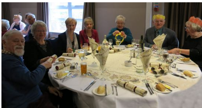
Members enjoying Christmas lunch at Eastwood Hall.

Eastwood & District U3A have amended the Gift Aid form in line with recent requirements from HMRC and all Gift Aid signatories need to sign an updated form. If you have received a new form by email, please print out, complete and post in the green box on the signing in desk. If you have signed a donation form for yourself and your partner, please include both membership numbers on the form. For those members who are not on the Internet, forms will be available from the Treasurer.