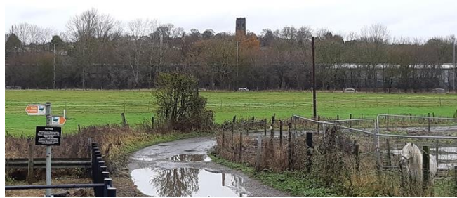
Figure 5 Now turn left back towards Langley Mill

Kingfishers are often seen along the canal, but I have also seen goldcrests just inches above my head in the branches.