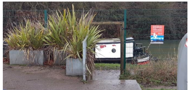
Figure 2 On the far side of the car park

For this walk we park in Lidl car park and cross the road through the KFC car park to a gate that gains you access to the canal. (fig 2)