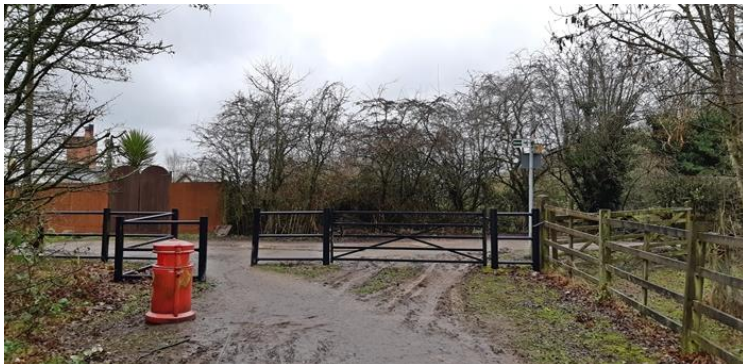
Figure 6 Turn right and follow the road back to the main road

When you get to the end of the path turn right (fig. 7) and follow the road back to the main road. Turn left, pass over the bridge and then left at the lights back to the car park.