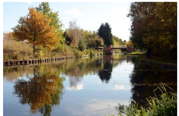
Figure 3 keep to the tow path past the first bridge

Turn right and follow the towpath passing this bridge and continue along until the next bridge. (Figure 3)