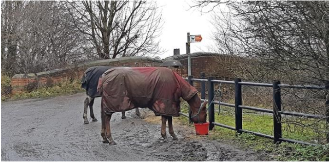
Figure 4 Ignore the sign to right carry on over the bridge

Around the corner ignore the sign to right (fig. 5) and continue over the bridge and follow the sign to the left (fig.6)