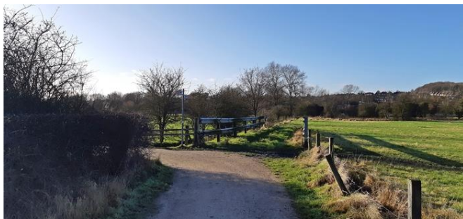
Figure 4 follow path to the left

When you reach the T-junction turn right. (Fig.3)