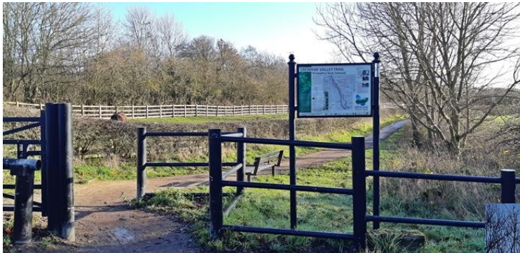
Figure 2 Follow this path parallel to the A610

Depending where you park the walk can be started at several places. I have chosen to start where the path crosses Newmanleys Road just after