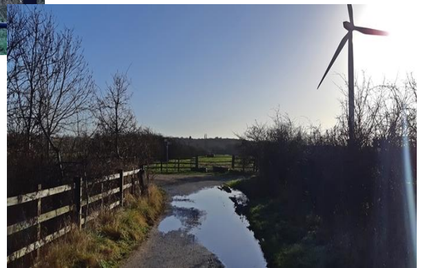
Figure 3 Turn right at the T junction

Winston the wind turbine is a big clue here.