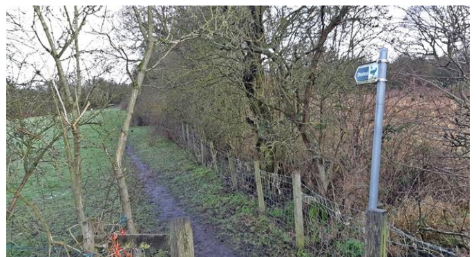
Figure 8 Last short cut is before the next lock to the right

Before crossing to the otherside of the canal at the next lock is a short cut to the right (fig 8)