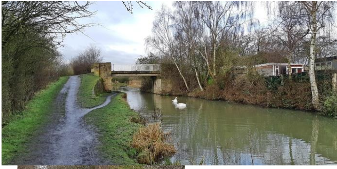
Figure 9 Turn right over this bridge

If not taking the short cut carry on over the canal at the next lock and continue to the next bridge. (fig. 9)