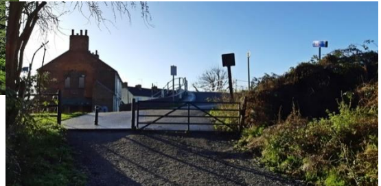
Figure 6 Turn right and follow the canal towpath

This path takes you over the river, then under the railway and lead you to the canal. When you reach the canal turn right. (fig 6)