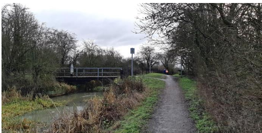
Figure 12 Turn left here if you parked immediately after turning onto Newmaleys Road

Follow this road and take the right before the next bridge, sign posted, (see fig 11)