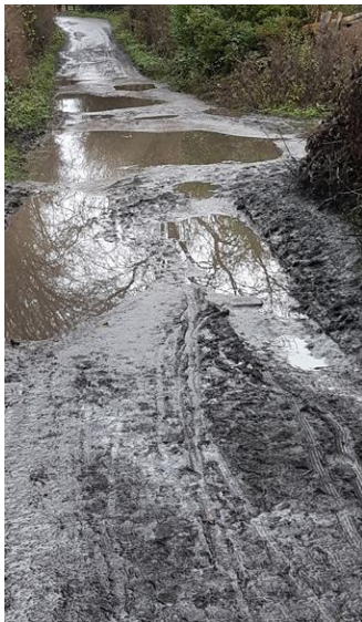
Figure 10 navigate this puddle with care

Over the bridge there is often a large puddle if there has been rain.