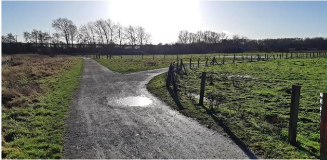
Figure 5 turn right heading towards the railway and over the river Erewash

This path takes you over the river, then under the railway and lead you to the canal. When you reach the canal turn right. (fig 6)