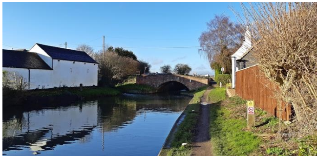
Figure 7 Short cut here otherwise keep following the canal

For a short cut back to your car you can turn right here (fig. 7). Of course, if you parked here you can give up now. Otherwise carry on until the next bridge following the path as it crosses the canal by the lock, then cross the bridge back over the canal.