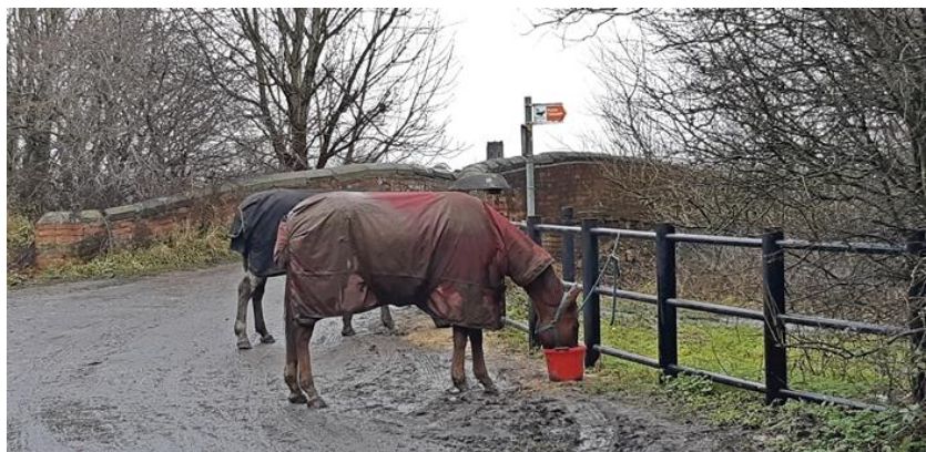
Figure 11 Follow sign posted path to the right before the bridge