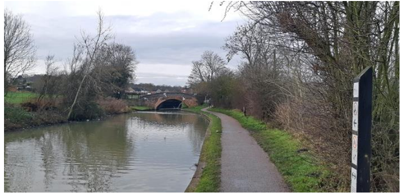
Figure 6 Turn right at this bridge and then right down lane

After the locks by the Inn, you will pass another lock and bridge before you come to a bridge over the canal (before Potters lock) (fig. 6) (0.8 mile after Gallows Inn, 16 mins depending how fast you walk).