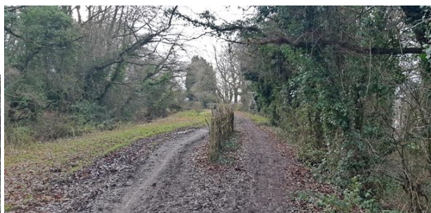
Figure 4 Turn right after this fence

Follow this path down the hill, over the private road, over the railway bridge, down to the main road to Ilkeston, then turn right. Be very careful here as there is no footpath on either side of the road for a short distance.