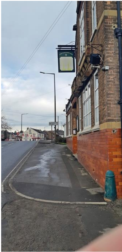
Figure 5 Turn right after Gallows Inn

After the Gallows Inn (shown in fig. 5) turn right alongside the canal and follow the towpath.