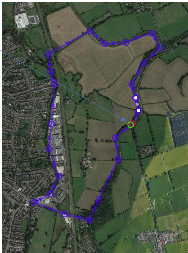
Figure 2 Satellite image of the walk