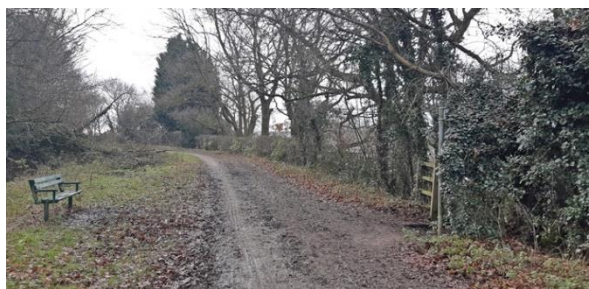
Figure 5 Turn right opposite the bench

Follow this path until you reach a bench on the left after this fence (fig.4 and 5) where you follow a footpath sign to the right.