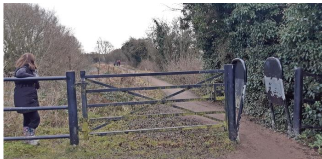
Figure 8 Turn right halfway up the hill alongside the canal

Follow the lane up the hill towards Cossall; when you reach the canal turn right (fig.8) and follow the tow path back to the car park.