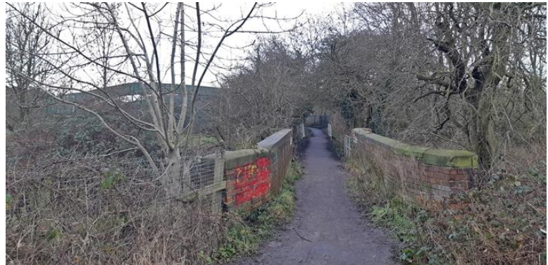
Figure 7 Turn left and go over this bridge and the railway bridge

Here you are going to do a U turn down a lane parallel to the canal and then turn left to cross the Erewash river and leading to a bridge over the railway. (fig.7)