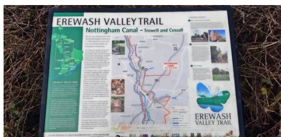
Figure 3 Turn to your left looking at this display.

From the car park looking at this display turn left in the direction of Trowell. (fig. 3)