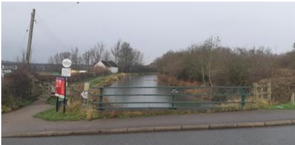
FIGURE 1 THE WALK STARTS ON THE OPPOSITE SIDE OF THE ROAD FROM THE CAR PARK

Overall, the walking is easy, canal path, Erewash path, concrete road and a lane.