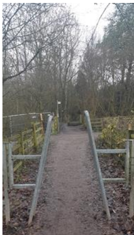
FIGURE 2 AT THE END OF THE CANAL CONTINUE AHEAD

Cross the road from the car park and proceed alongside the canal back towards Kimberley.