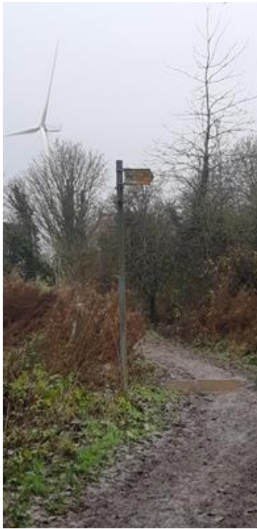
FIGURE 3 RIGHT