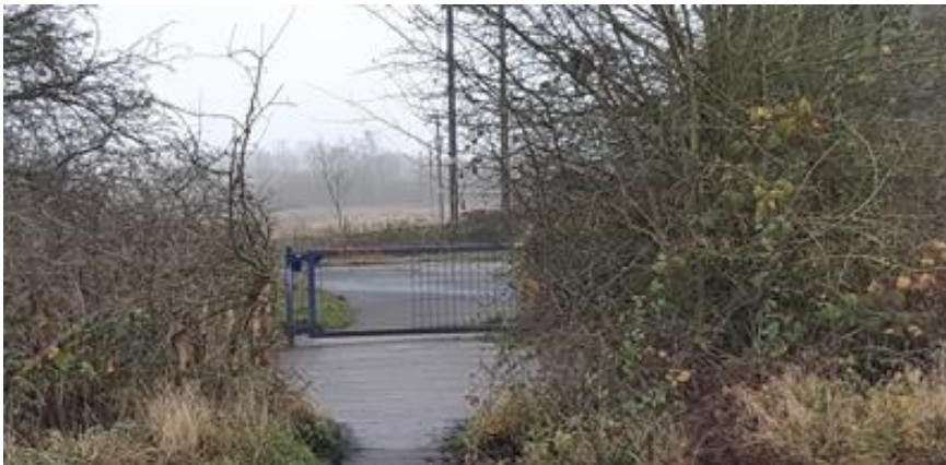
FIGURE 4 SHIMMY THROUGH THIS GATE

Through this gate and under the viaduct to the right is a lane which takes you back to the road to Cotmanhay.